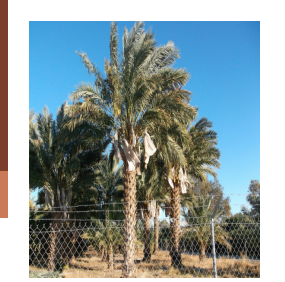
Photo Contest at BCHI State Convention in March. See also the www.bchi.org web site: